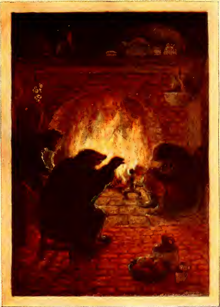
WHERE TWO OR THREE FRIENDS OF SIMPLE TASTE COULD SIT ABOUT AS THEY PLEASD